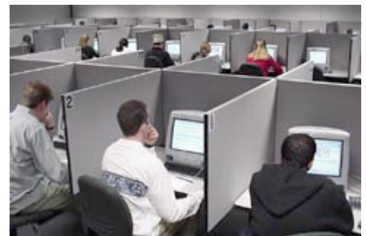
The Testing Center